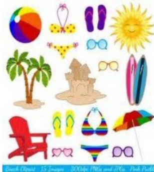
Beach Chair - 15 Images - 300dpi PNG and JPG - Pack Photo

Silver & Fit Excel Strength/Cardio Class 6:00-6:45 p.m.